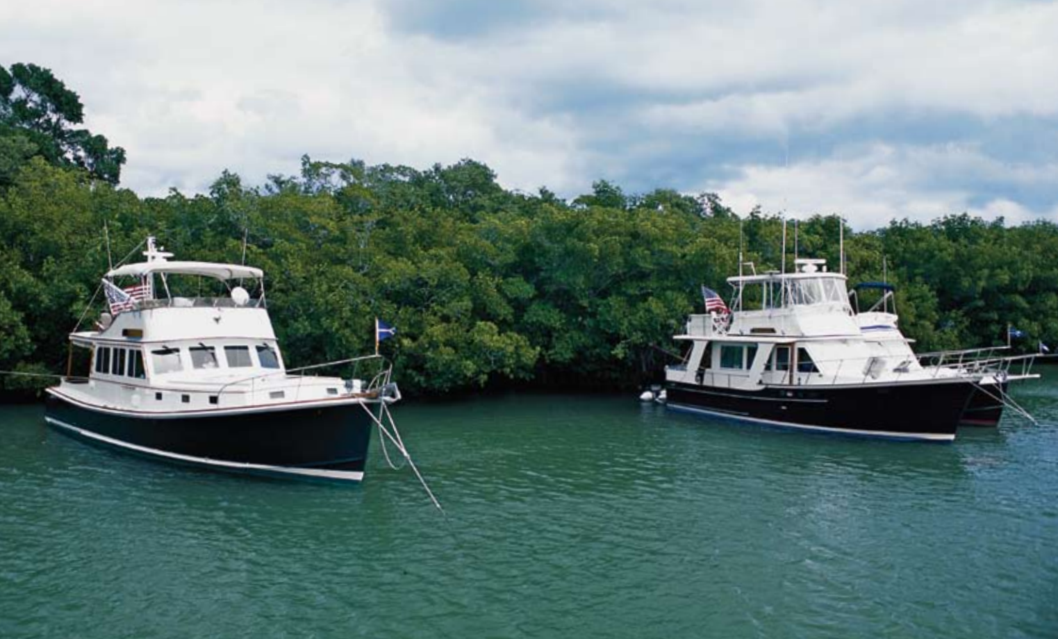
Flanked by mangroves to the east, Gasparilla Basin (above) is just a short dinghy ride from the town of Boca Grande.