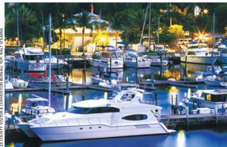
Ft. Myers Yacht Basin is one of many first-class marinas in the area available for those seeking an alternative to anchoring.

"If you do touch bottom or run aground, the first thing you should do is nothing ," Marc counsels. "Don't rev the engine or make any hasty moves," he explains. "Take a couple of moments to look around and see what the current and wind are doing. Worst case, you can always set an anchor and wait till the tide comes up, kedging off if need be."